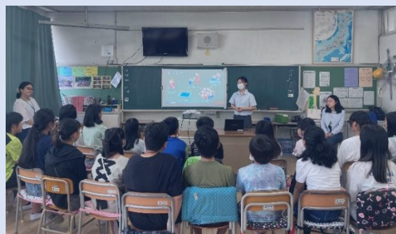
Presentation at local school