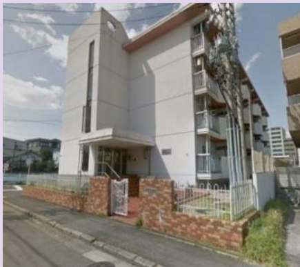
Exterior view of the dormitory

Self-contained private flat, furnished (desk, chair, closet (Japanese style), futon bedding, refrigerator, gas stove, microwave, washing machine, bathroom (toilet and bath), A/C, Wi-fi available.