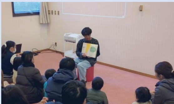
Picture book reading at local library